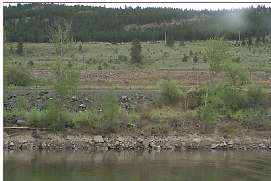
LEFT BANK VIEW