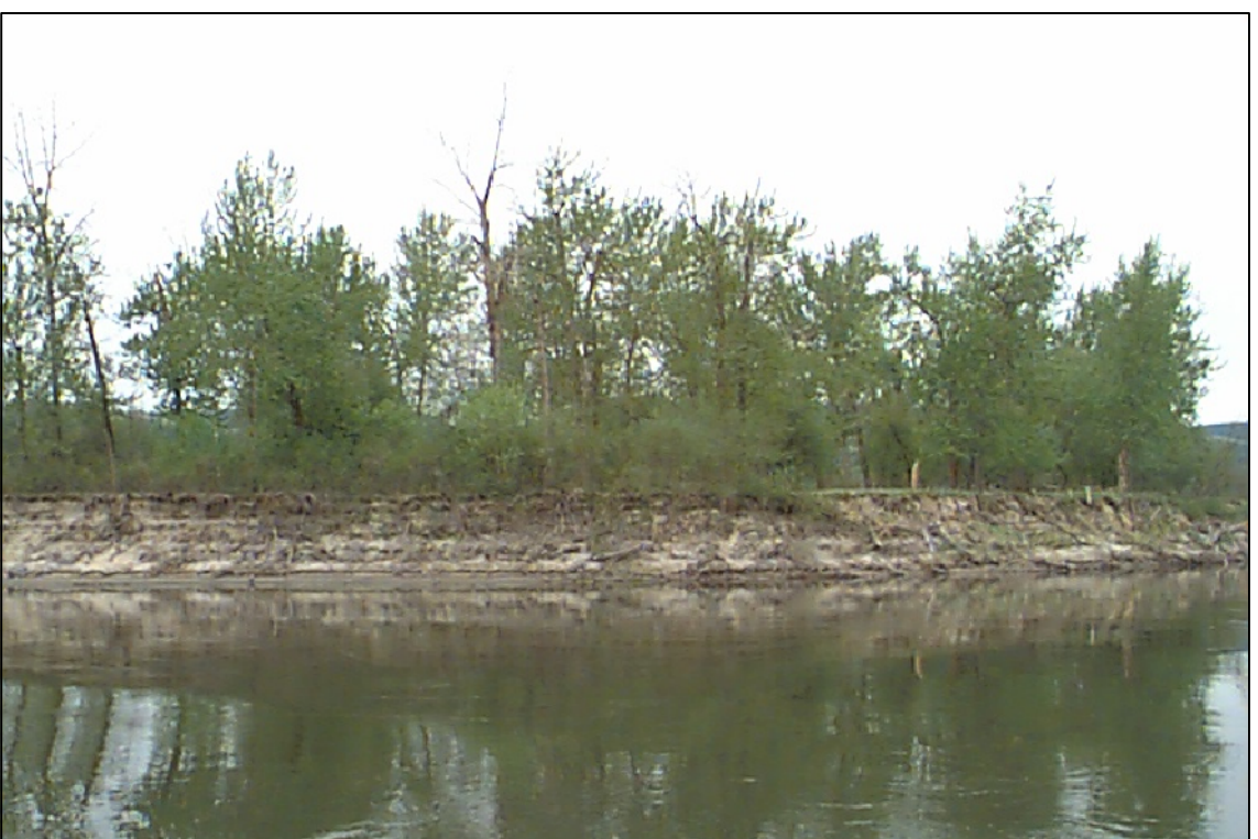
RIGHT BANK VIEW